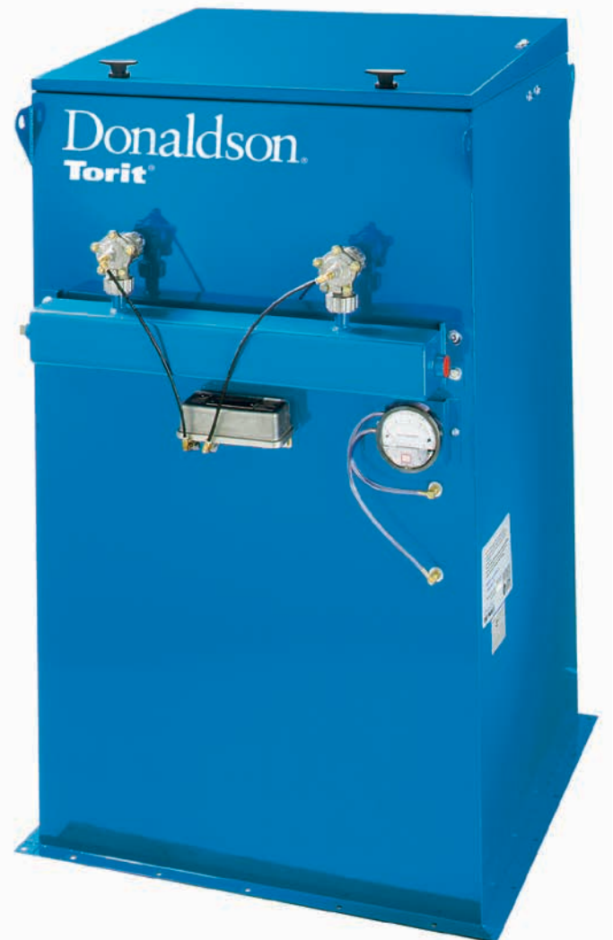
TBV-4 with Plenum

ULTRA-WEB® High Efficiency Fine Fiber Filters Built to Last