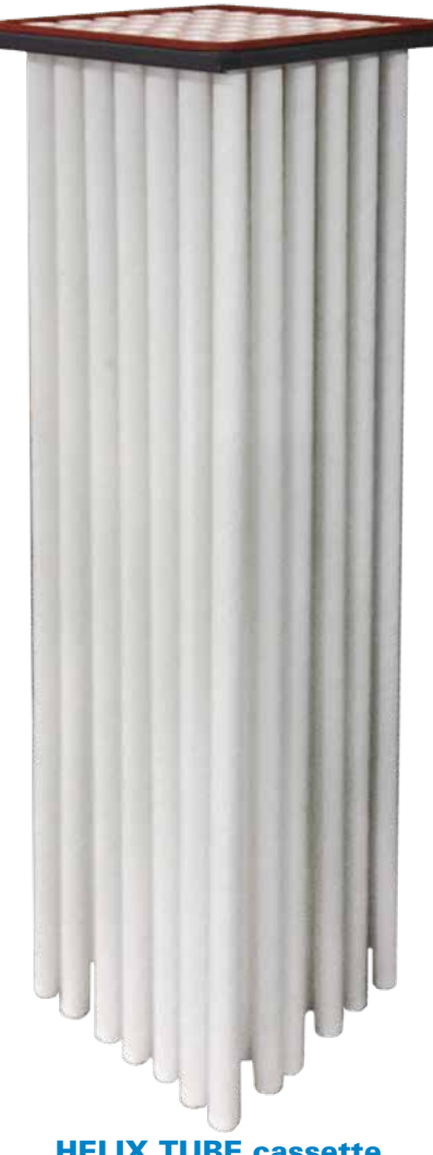
HELIX TUBE cassette