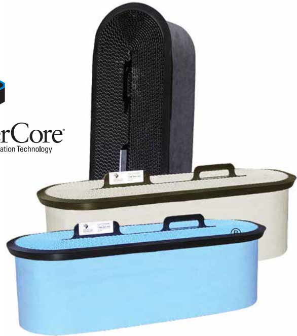
PowerCore® CP Filter Pack

PowerCore® A Donaldson Filtration Technology